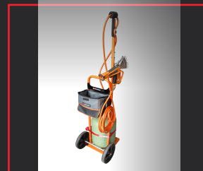
936 GAS BOTTLE TROLLEY