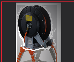
GAS HOSE REEL